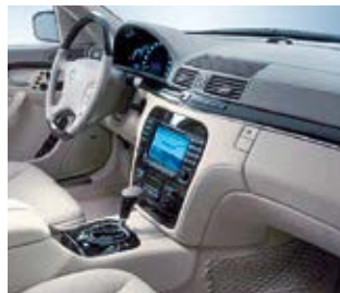
TEST MACHINES FOR AUTOMOTIVE SECTOR