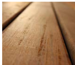
WOOD MILLING MACHINES