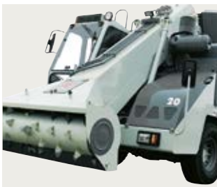
AGRICULTURAL AND EARTH-MOVING MACHINES