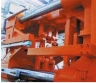
PLASTIC AND RUBBER INJECTION PRESSES