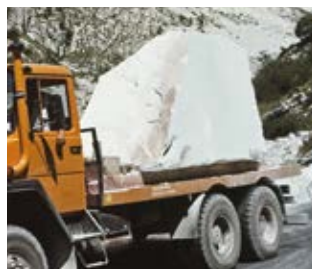
SURFACE TREATMENT MACHINES