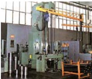
HYDRAULIC AND PNEUMATIC CYLINDERS